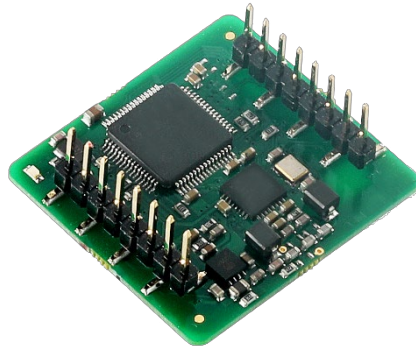
TWN4 MultiTech HF Mini (exemplary illustration)

Single-frequency HF RFID module with NFC support